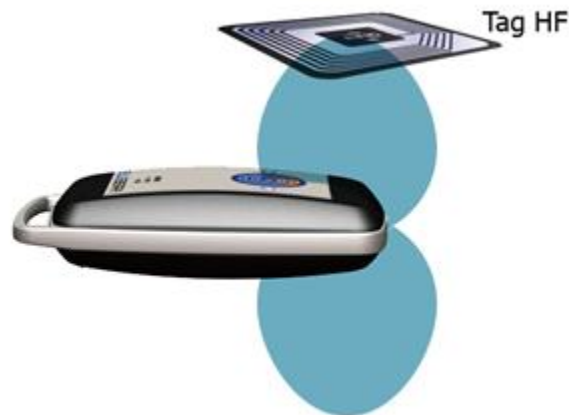
Figure 2 – Scanfob® NFC-BB2e Read Field

Optimal conditions for reading are to position the antenna end of the reader directly above or below the NFC tag. See Fig. 2 below.